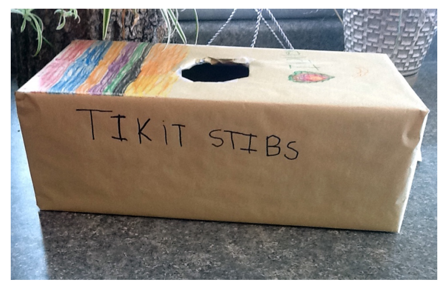
Figure 2. A box to collect movie tickets is labeled as "TIKiT STIBS" [ticket stubs].

The children also created movie posters to inform others about the films featured at the theatre, menus to inform customers as to what food they could purchase at the concession stand and for how much, and labels to identify the items stored on the shelves in the concession stand (Figure 3).