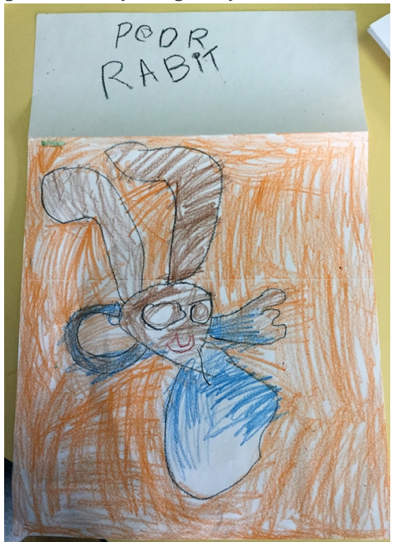
Figure 4. A poster for the "Peter Rabbit" movie.

the teachers provided the children with a pre-printed template showing the features specific to this genre of text (see Figure 5).