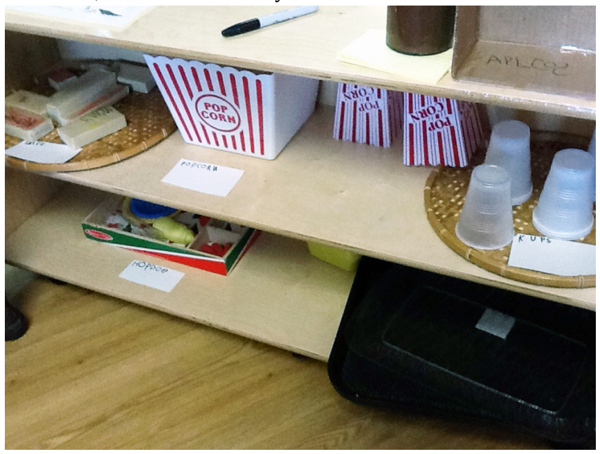
Figure 3 . Concession stand items were labeled as "KUPS" [cups], "POPCORN", "HOpDoe" [hot dog], and "KANDE" [candy].

The children also created movie posters to inform others about the films featured at the theatre, menus to inform customers as to what food they could purchase at the concession stand and for how much, and labels to identify the items stored on the shelves in the concession stand (Figure 3).