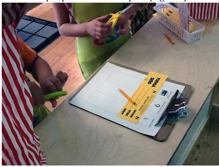
Figure 6. Employees prepare tickets at the box office.

BOX OFFICE. At the box office, the "ticket seller" wrote the title of the movie along with the date and time on the pre-printed ticket template (Figure 6).